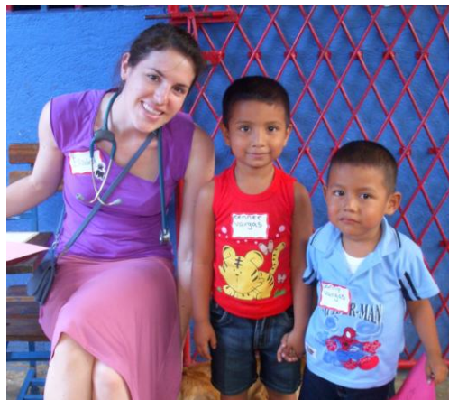
Nursing student at La Escuelita