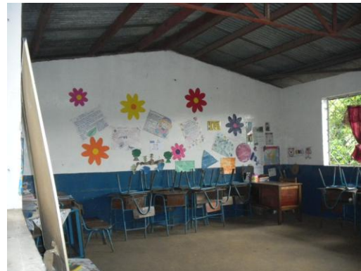
Two room school house in El Castillo