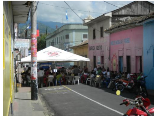
Health Fair in Matagalpa