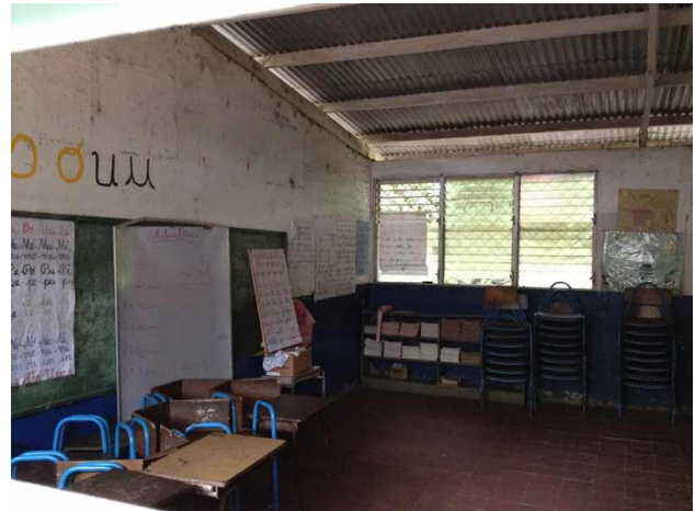
Elementary School Classroom