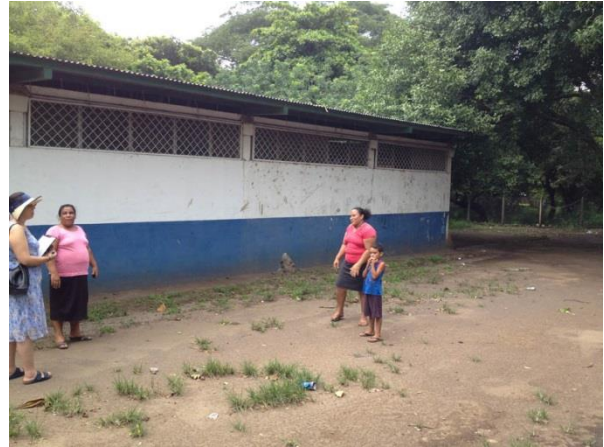
School Building 2