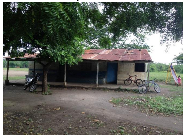
Community Building Renovation Project