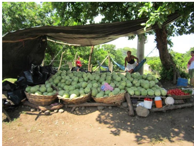
Fruit Stand in Trohilo