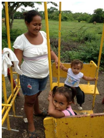
Trohilo Community Members

All proceeds will benefit the people of Nicaragua!