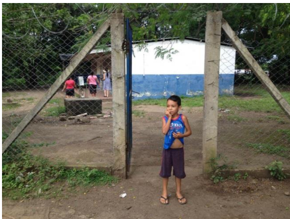
Entrance to School Compound