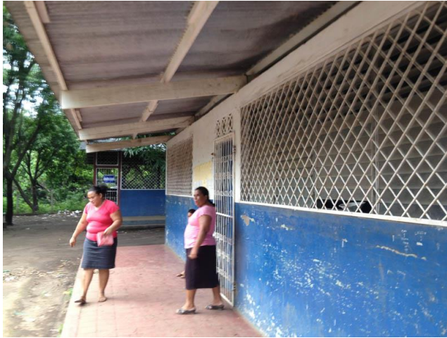
School Building 1