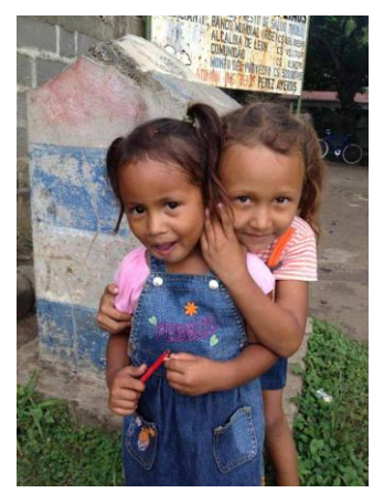
Children in Trohilo

Nicaragua 2013 Event Page: We also have an event page for the Nicaragua 2013 trip: <a href="https://www.facebook.com/events/288131231290964/">https://www.facebook.com/events/288131231290964/</a> Please confirm your attendance on this page. We will use this event page to stay in touch with each other before and after the trip.