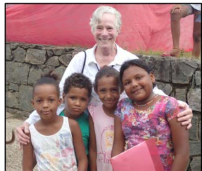
Children of Serra Grande