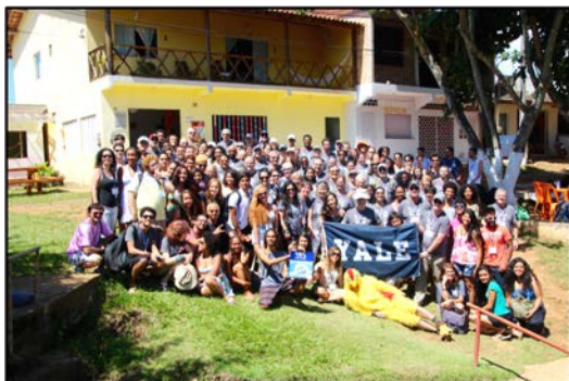
YASC group photo with UESC student