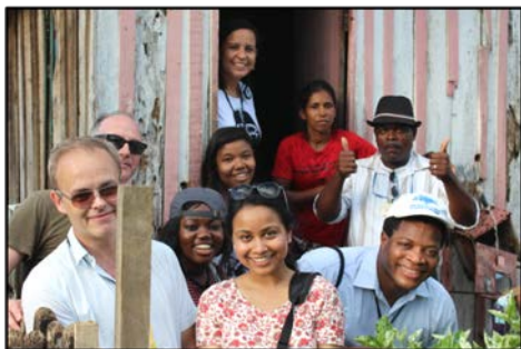
YASC volunteers during home visit