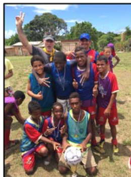
World Cup Serra Grande 2016