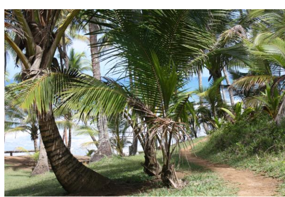
Newsletter #2 February 2016